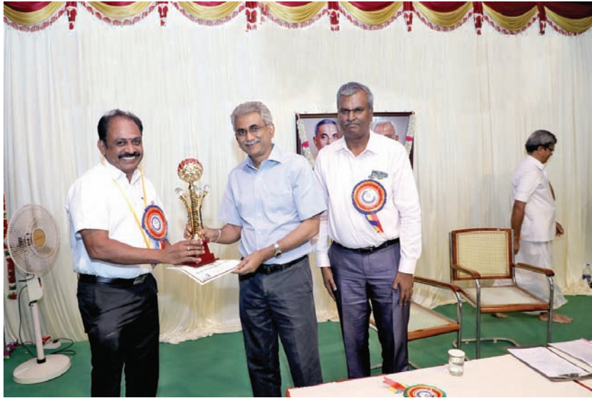
Our Senior General Manager receiving Japanese Management Practices (JMP) award from our Chairman at our Annual sports day function.